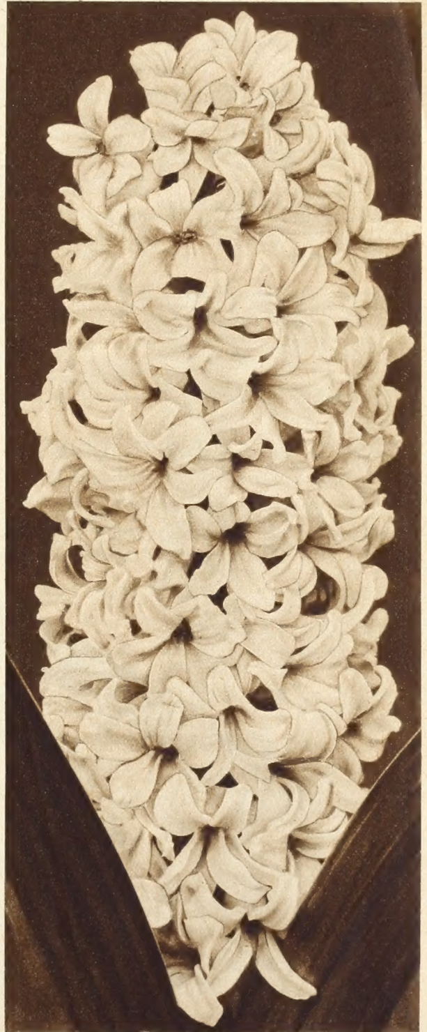
HENDERSON'S EXHIBITION HYACINTHS

Collection B. One each of the 9 Double Belled Varieties. $1.75.